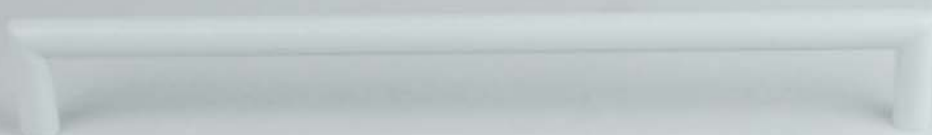
tfplus cabinet handle collection